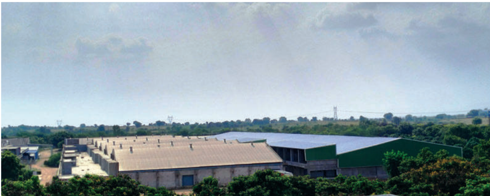
VORTEX @ URUKONDAPET UNIT